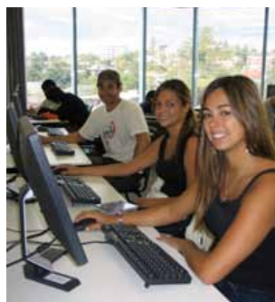
Study centre/computer room

Kaplan Aspect's activities co-ordinator produces a monthly calendar of exciting social activities around Sydney and at places of interest in New South Wales.