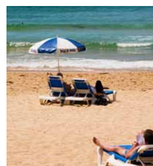
Relaxing on Manly Beach