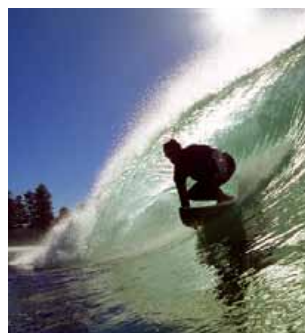
Surfing at Manly Beach