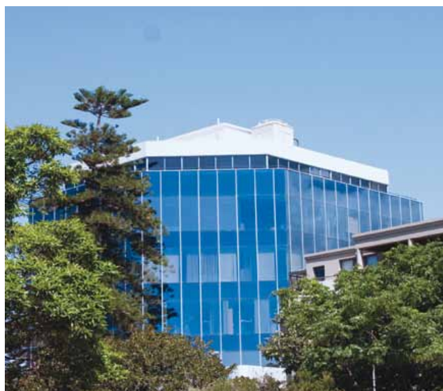
Kaplan Aspect Sydney Manly

With 21 classrooms offering views of Manly Beach, the harbour and Sydney city centre, you couldn't ask for a better study location. All classrooms are modern and air-conditioned with all the equipment you will need for effective learning. Other facilities include three common rooms, two wonderful outdoor balconies and a multimedia library where students can access a variety of online and audio-visual resources.