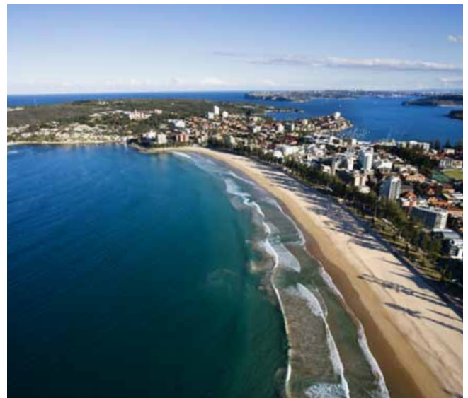
Manly Beach and Sydney City centre in the distance