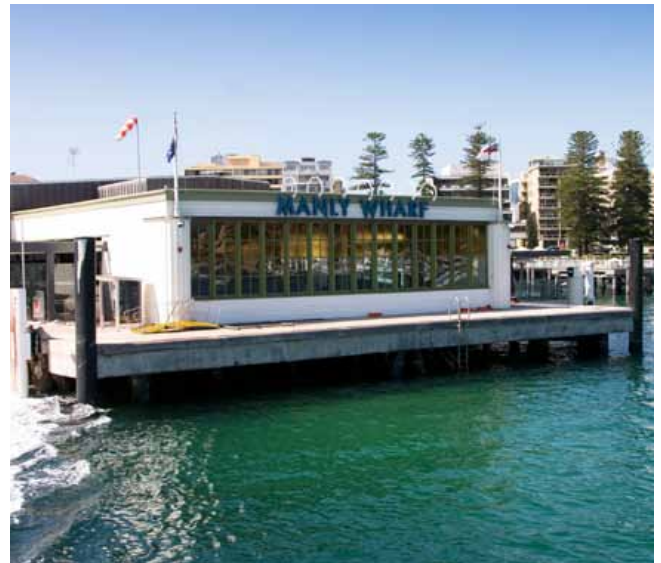
Manly Wharf Ferry Terminal

$14 one way will take the student from Domestic or International Airport to Circular Quay, Town Hall or Central Station, where student can catch a connecting bus, train or ferry. Journey time is approximately 20 minutes to Circular Quay from the airport.